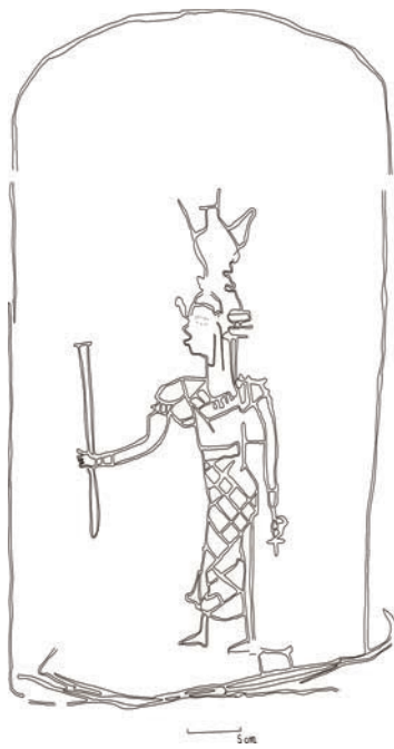
Isis within a shrine on a sacred barque, from the “tank” on the roof of the Mammisi. Drawing by the author.