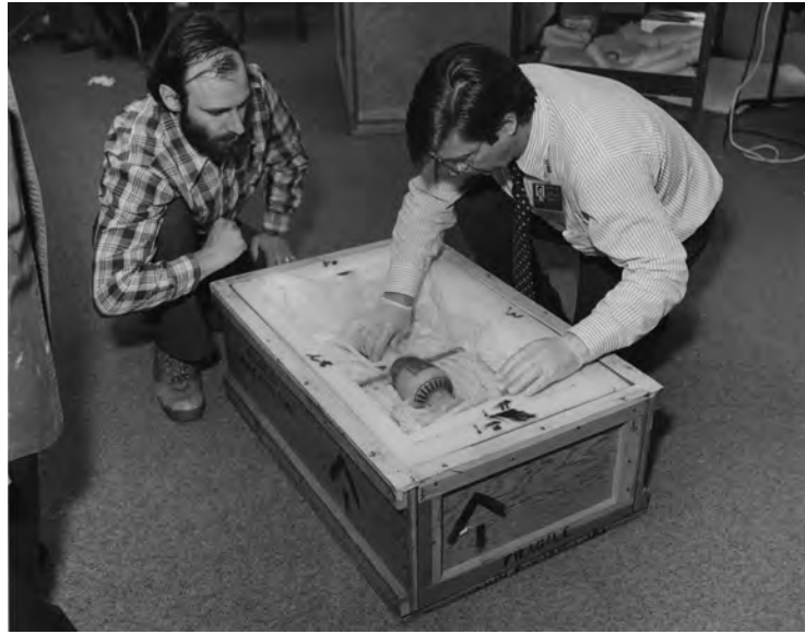
Figure 2. Unpacking the objects for the exhibition, Treasures of Tutankhamun, in Toronto, 1979.