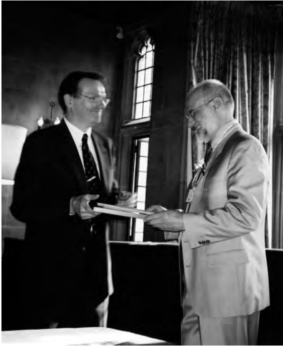
Figure 3. Receiving the Faculty of Arts & Science Outstanding Teaching Award, 2004.