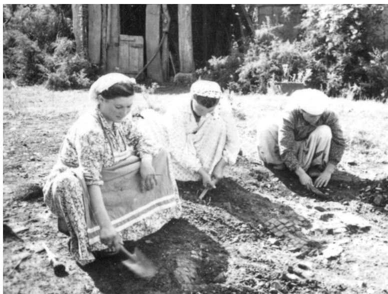
Figure 0.5. Cleaning the mosaic in 1960.

In 2003, members of our team became aware of plans being formulated by the Ministry of Transportation of Albania to improve communications between Tirana and Vlora. An extension to the national highway of Albania was planned that would bypass the city of Fier. The highway would run west of the acropolis of Apollonia, through its lower city and cemeteries, and would clip the eastern edge of the site of Bonjakët. In one fell swoop, a quiet, isolated, and largely vacant rural landscape would be exposed to the hustle and bustle of economic development.