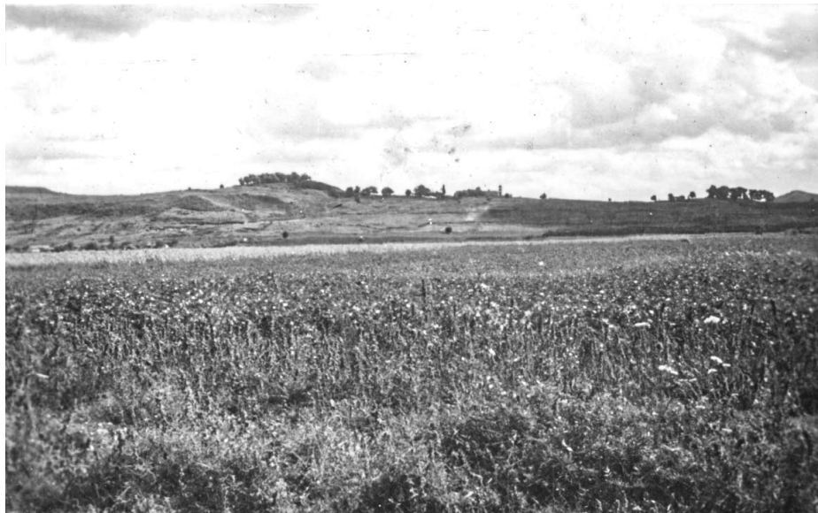
Figure 0.2. View of the Apollonia acropolis from the Bonjakët site in 1960.