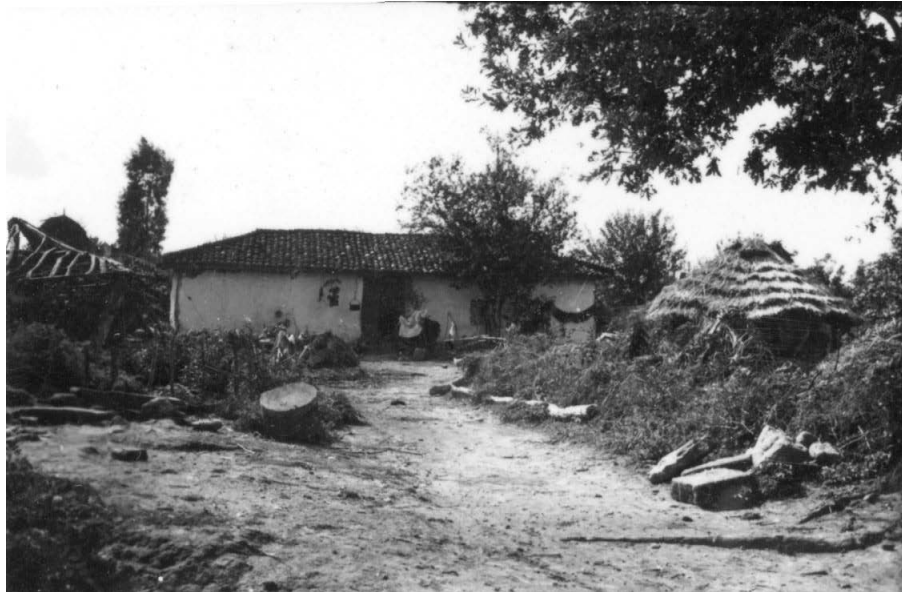
Figure 0.3. The Bonjakët compound in 1960.