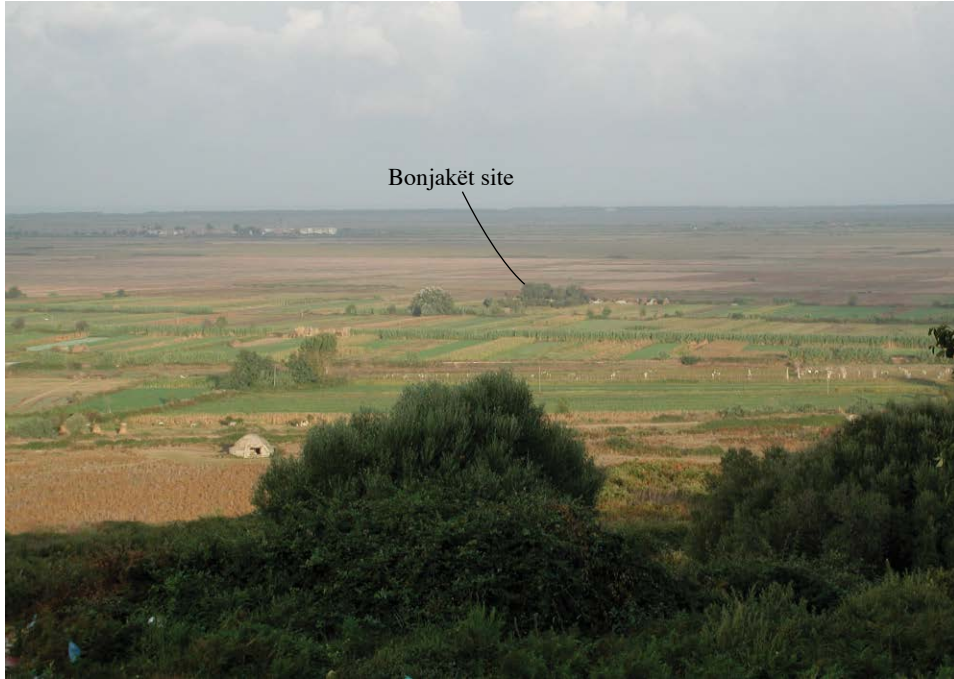
Figure 0.1. The Bonjakët site viewed from the Apollonia acropolis. Department of Classics, University of Cincinnati