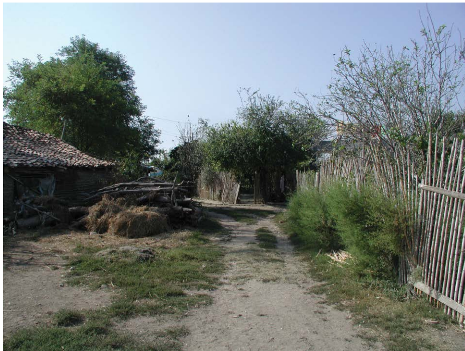
Figure 0.4. The Bonjakët compound in 2004. Department of Classics, University of Cincinnati